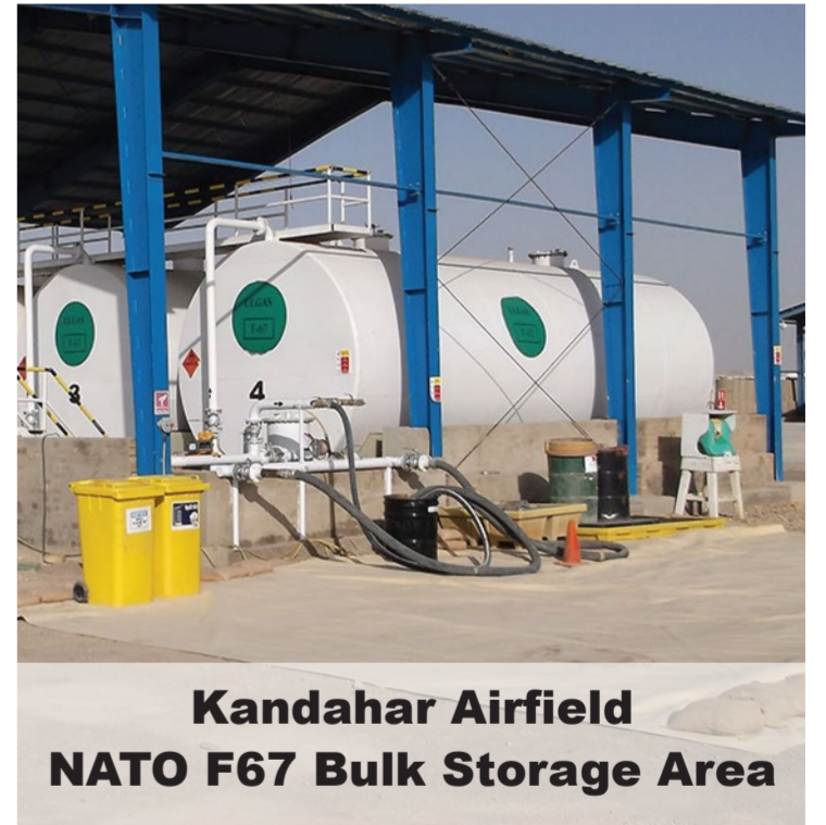
Kandahar Airfield NATO F67 Bulk Storage Area