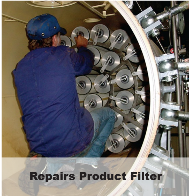
Repairs Product Filter