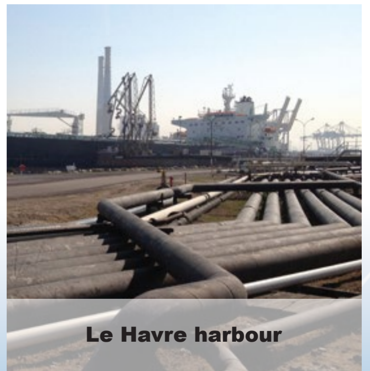
Le Havre harbour