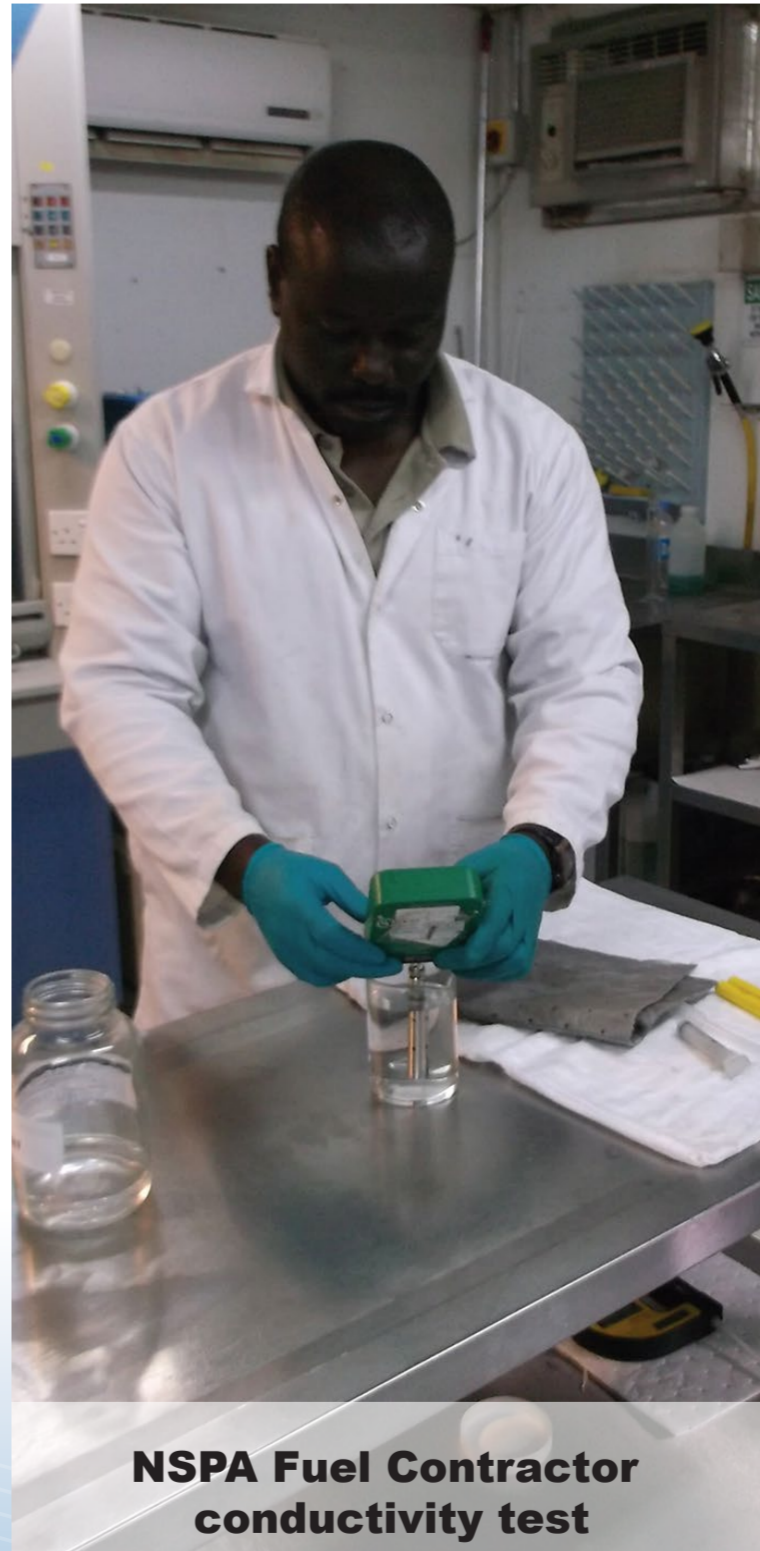
NSPA Fuel Contractor conductivity test